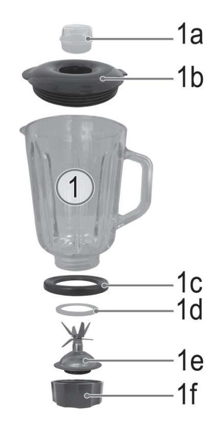
Fig. 4 Assembling Mixing Jar